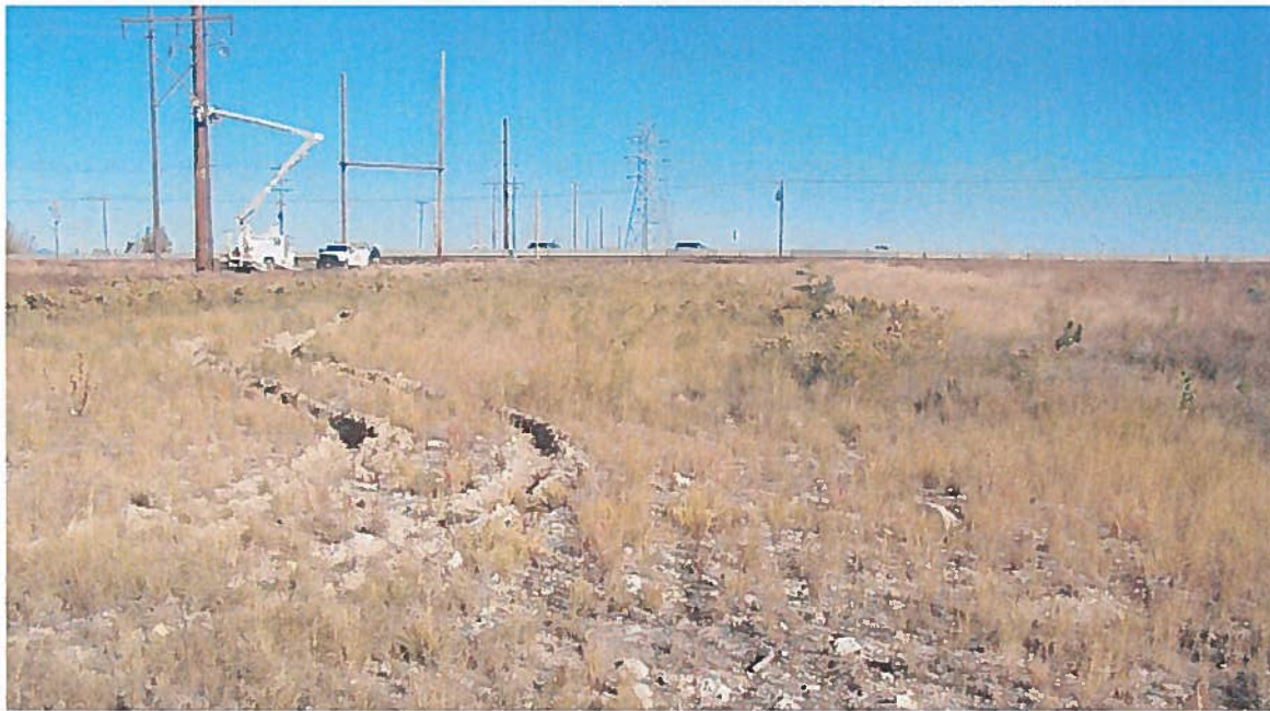
Damage on SDS easement, on South side of Highway 50 done by Black Hills Energy during transmission line construction. Per CSU this is to be addressed by Black Hills.