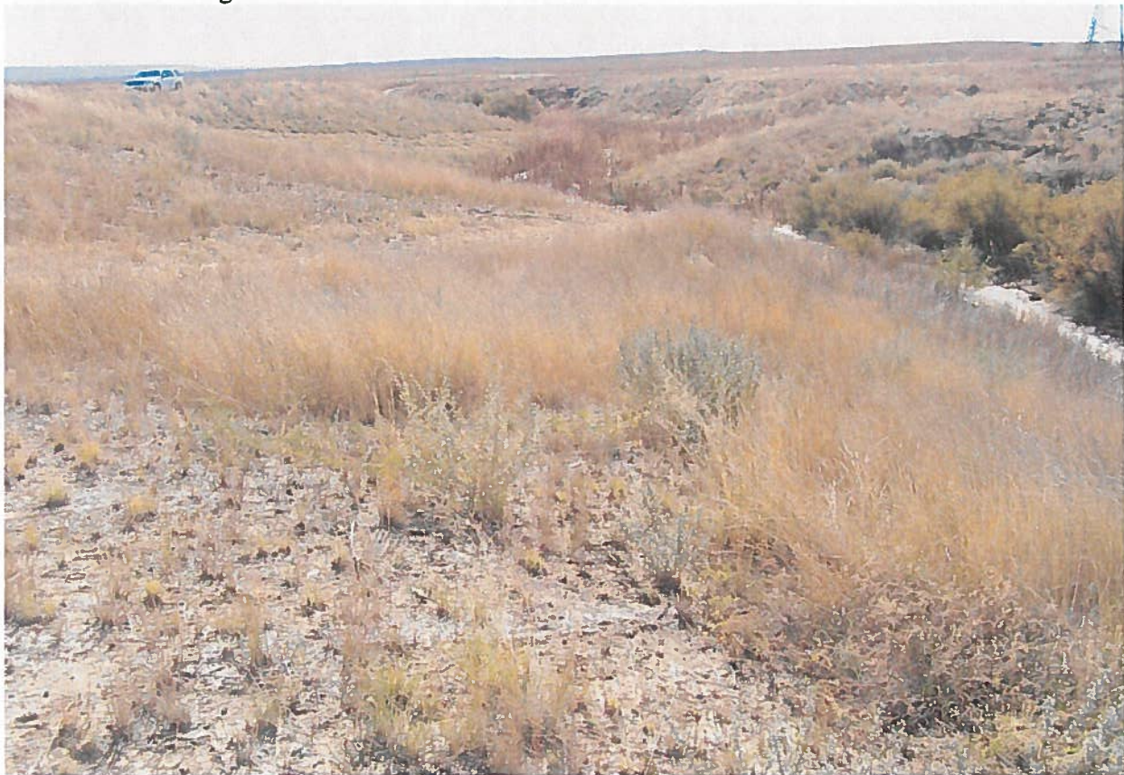
Looking East at Steele Hollow drainage channel reconstructed per Army Corp permit requirement.