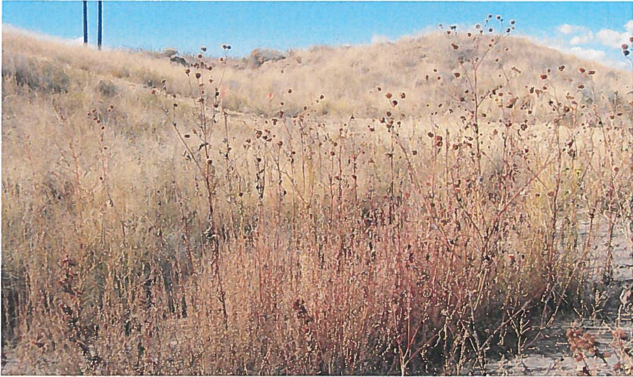
Steele Hollow drainage channel.