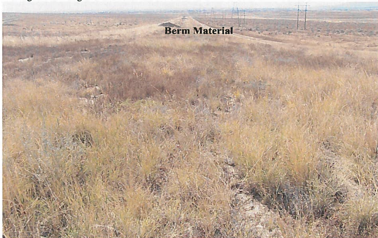
Looking South along SDS easement on Walker Ranches at Berm construction per Walker Ranch Agreement.