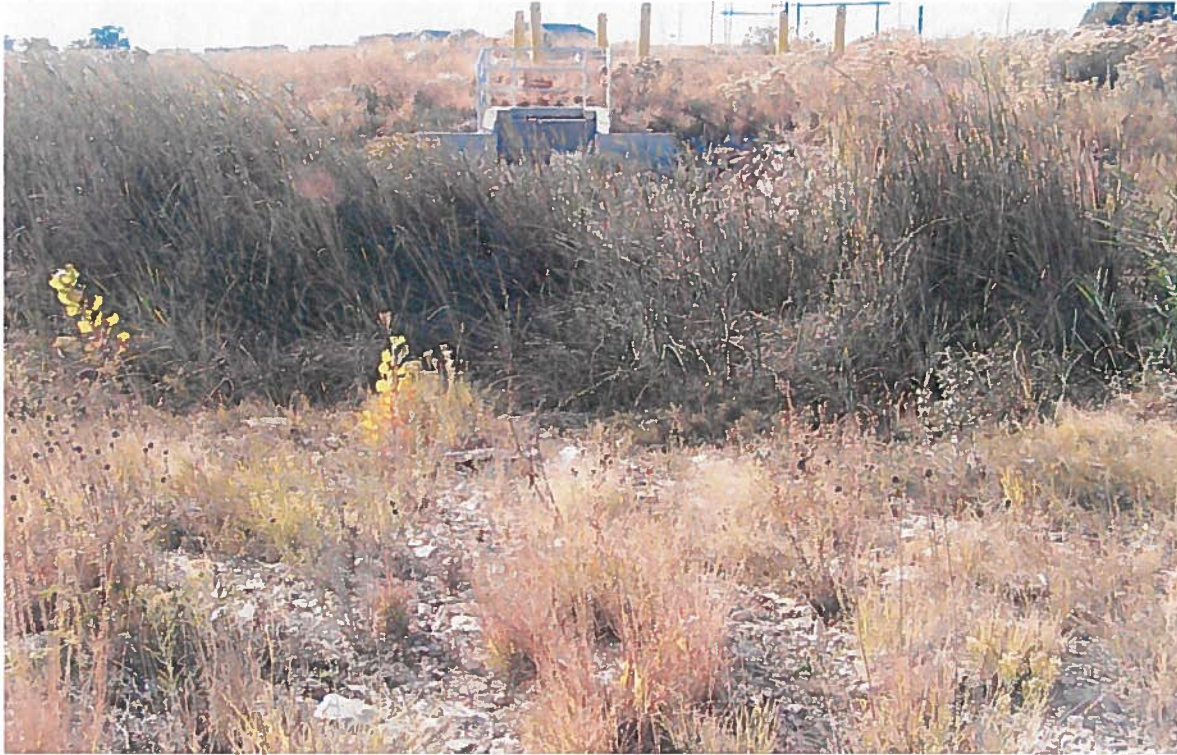
Blow-off structure at Wildhorse Creek tributary along Highway 50 showing wetlands revegetation.