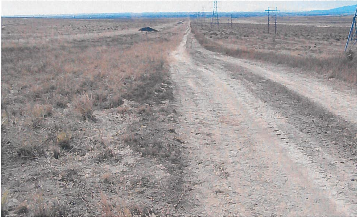
View South along SDS easement on south end of Walker Ranches showing construction access road and Berm construction.