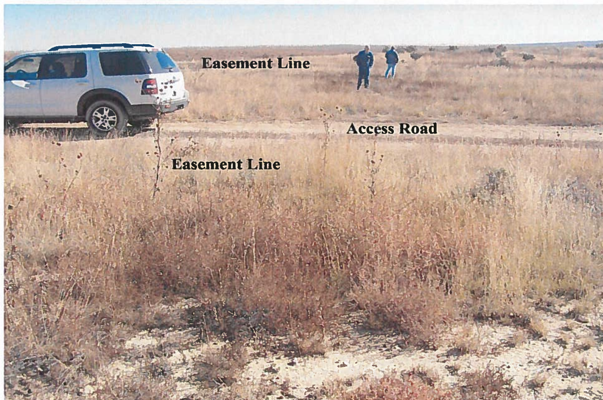
View across easement on Walker Ranches at the South end of S-3.