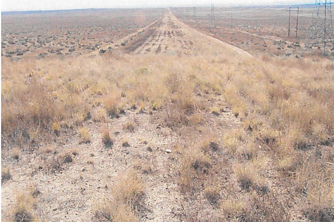
Looking south from North end of Walker Ranches property.