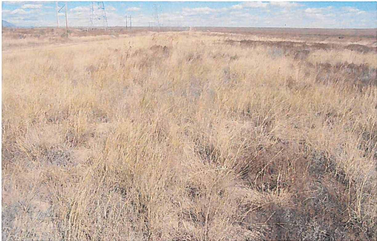
Looking North along SDS easement from Steele Hollow.