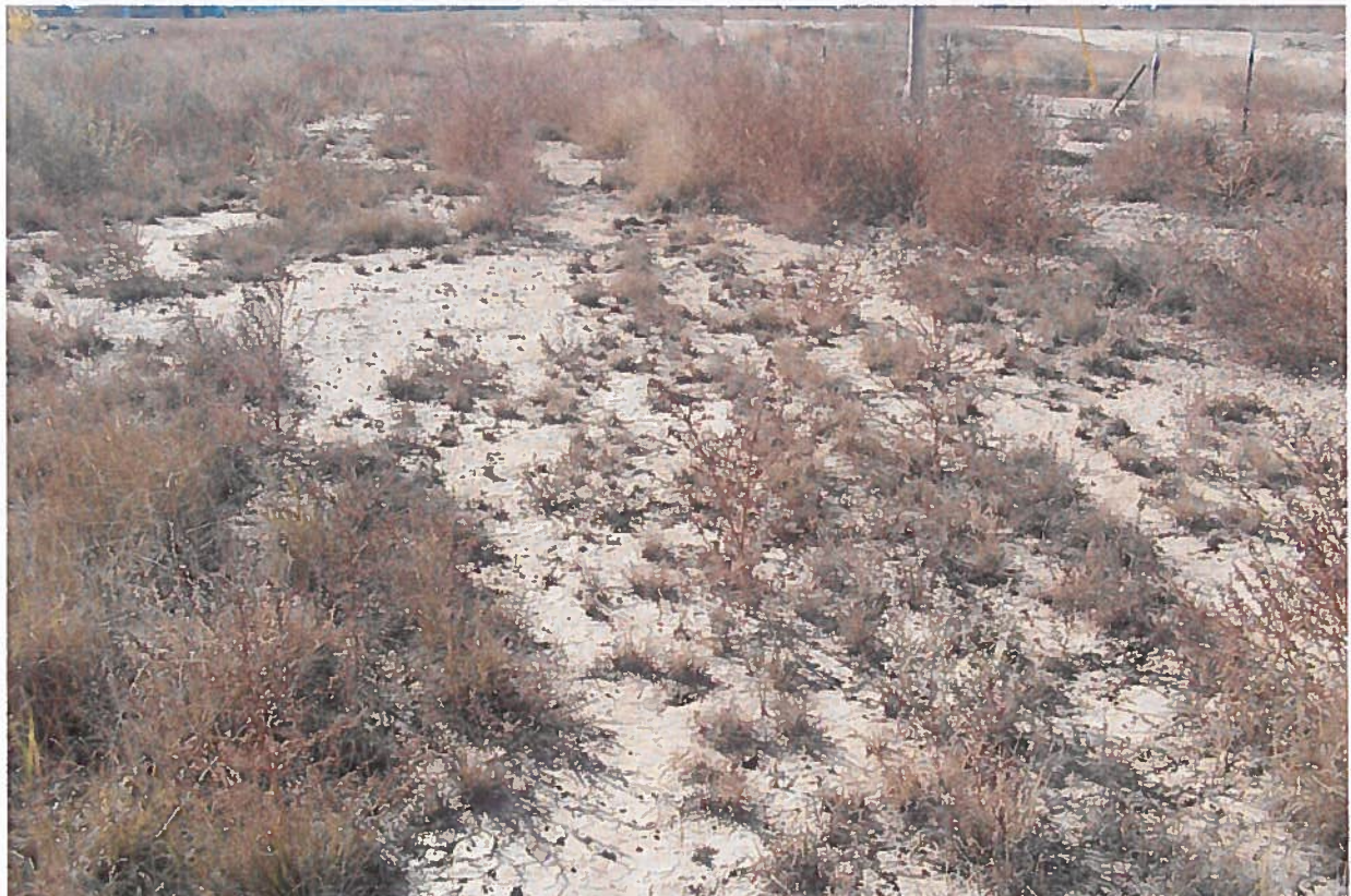
Erosion on the North end of S-2 in Pueblo West. This issue is being addressed by CSU and Pueblo West.