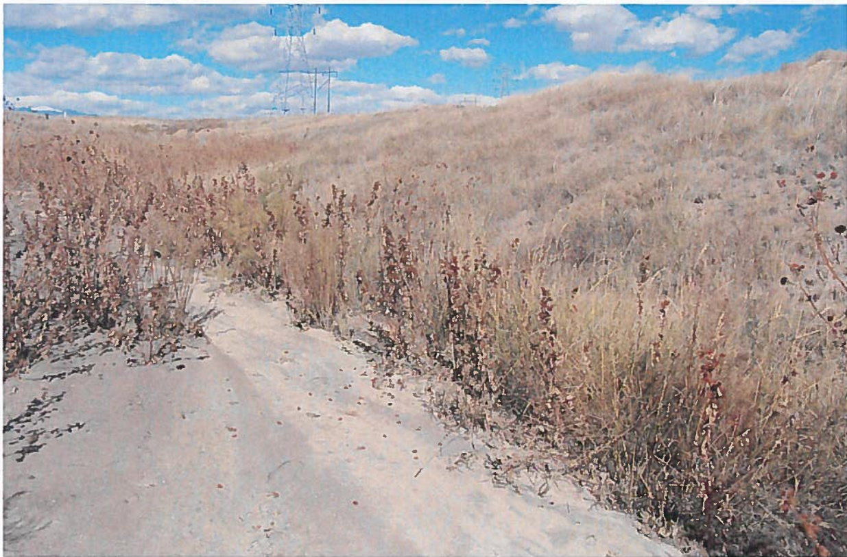
Looking West across SDS easement along Steele Hollow drainage channel.