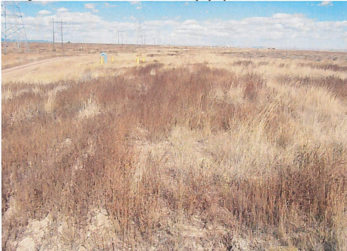
Looking North at a Blow-off structure at the end of Walker Ranches and start of Midway Ranch property.