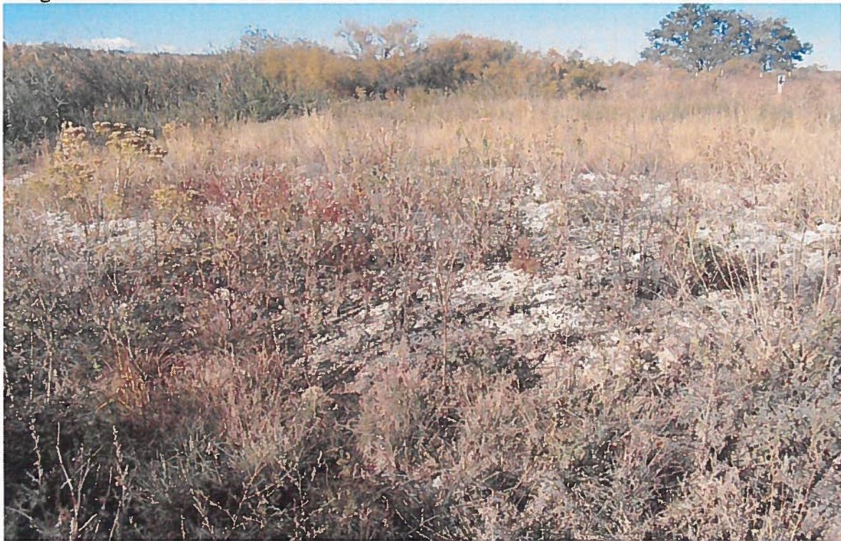
Looking East across easement at wetlands in Wildhorse Creek tributary.