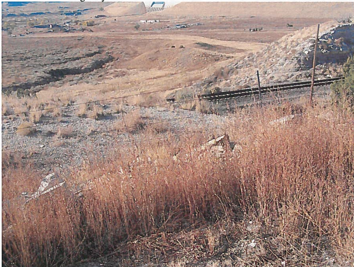
Looking South from railroad bore at the SDS route to the Juniper Pump Station at Pueblo Reservoir along BOR/State Parks property.