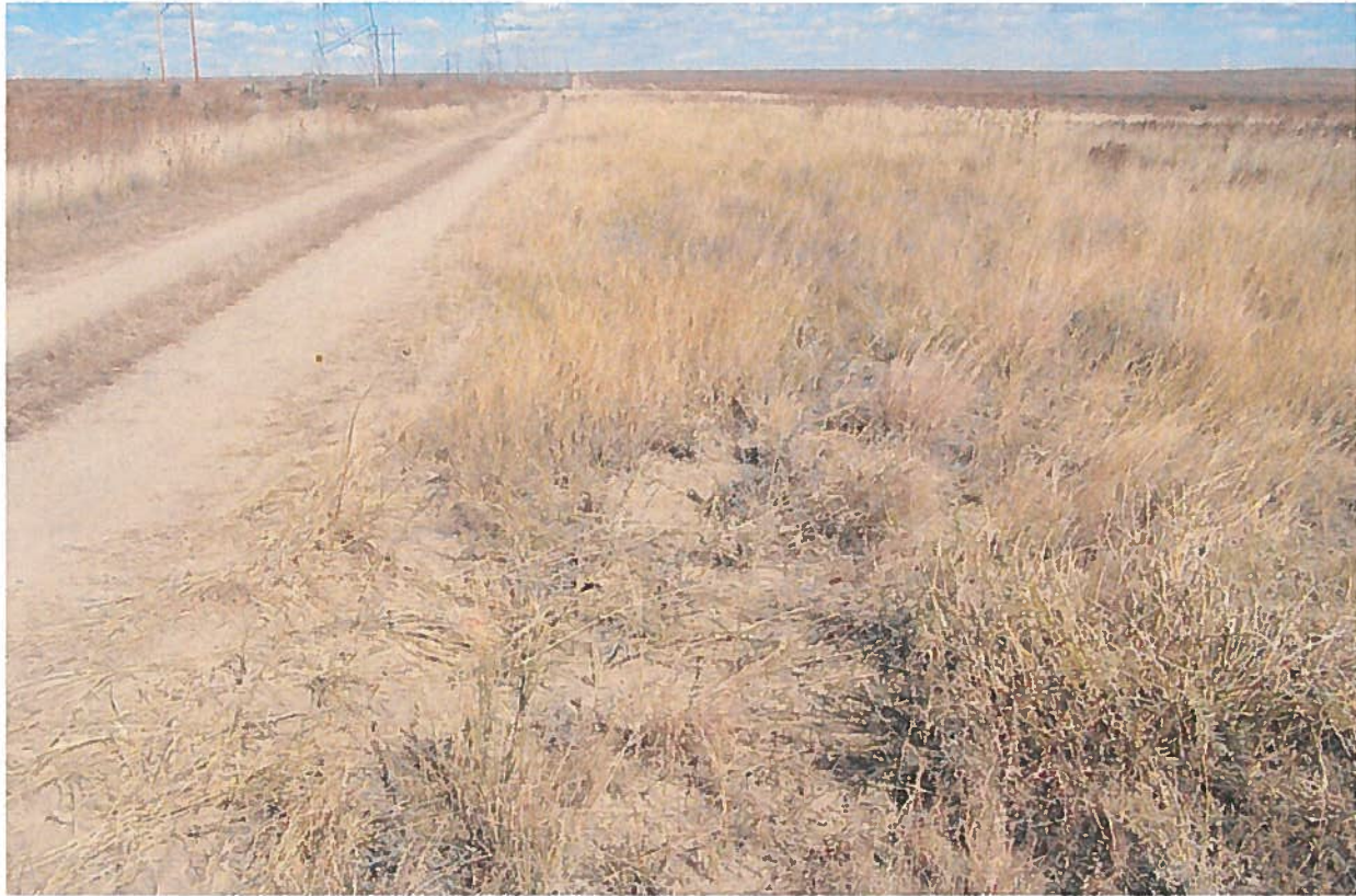
Looking North from South end of S-3 along SDS easement on Walker Ranches.