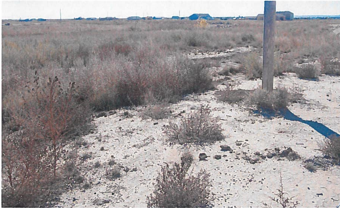
Erosion area along SDS easement on North end of S-2 in Pueblo West.