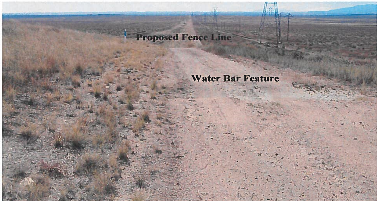
Looking south along access road (previously revegetated) for SDS improvement work per Walker Ranches Agreement.